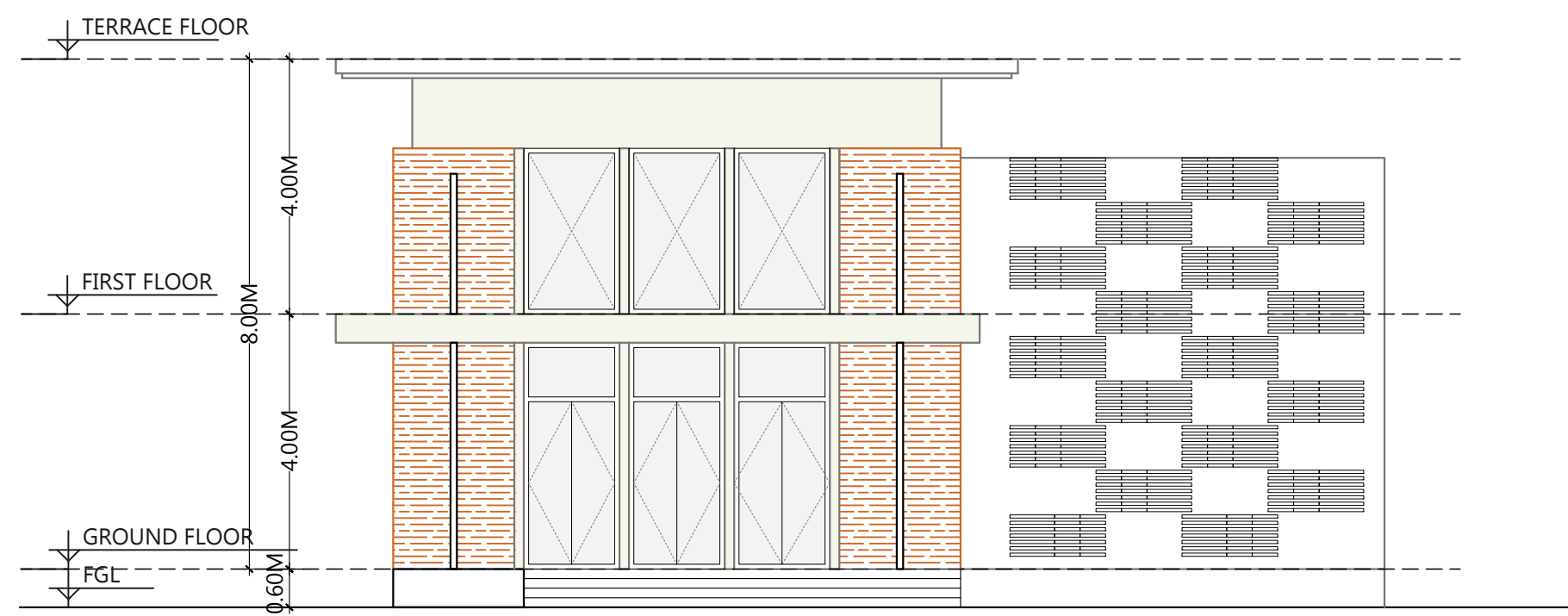
E1 ELEVATION Scale: 1:100