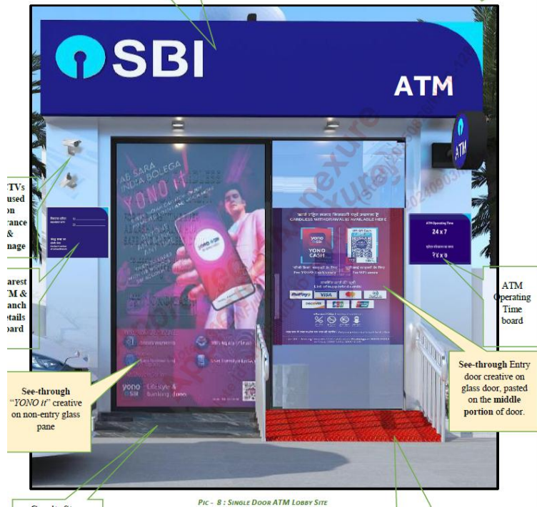
Pic - 8 : SINGLE Door ATM Lobby Site

(See-Through sticker films for Glass door and Fixed Glass)